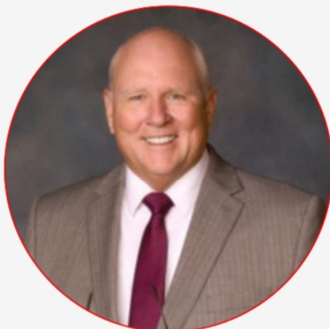
HARRIS COUNTY PRECINCT 3 COUNTY COMMISSIONER TOM RAMSEY